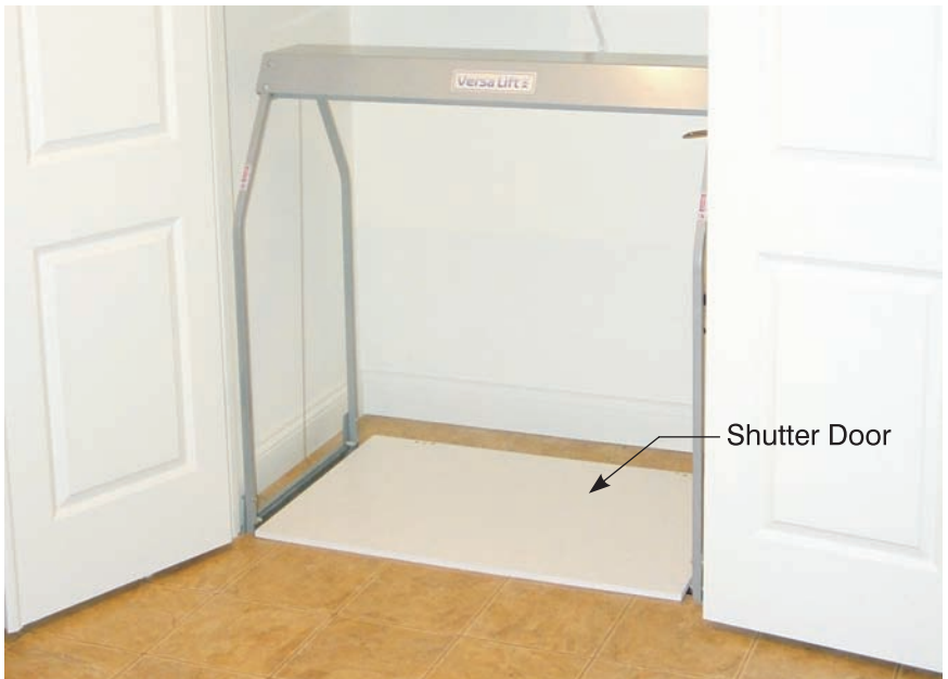
Fig. 3: When the lift platform is down, the shutter door rests on the floor.